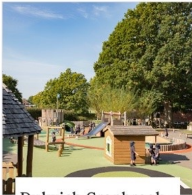
Dulwich Cranbrook - Nash House Nursery Cranbrook