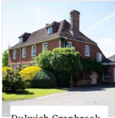
Dulwich Cranbrook - Prep School Cranbrook